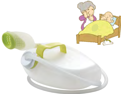
Wearable type for sleeping position

Wearable urinary collector for sleeping position. You can wear it to bed.