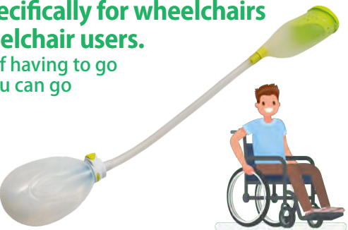
Wearable type for wheelchair use

A urinary collector made specifically for wheelchairs that was developed for wheelchair users. It reduces the anxiety and burden of having to go all the way to the bathroom, and you can go outside with a peace of mind.